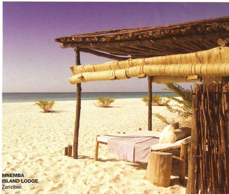
MNEMBA ISLAND LODGE Zanzibar.